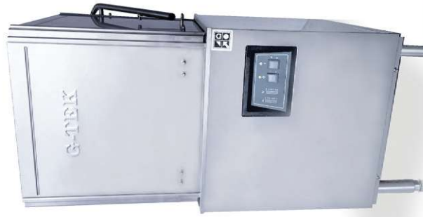
ECONOMICAL DOOR TYPE DISH WASHER GT-D1M EC