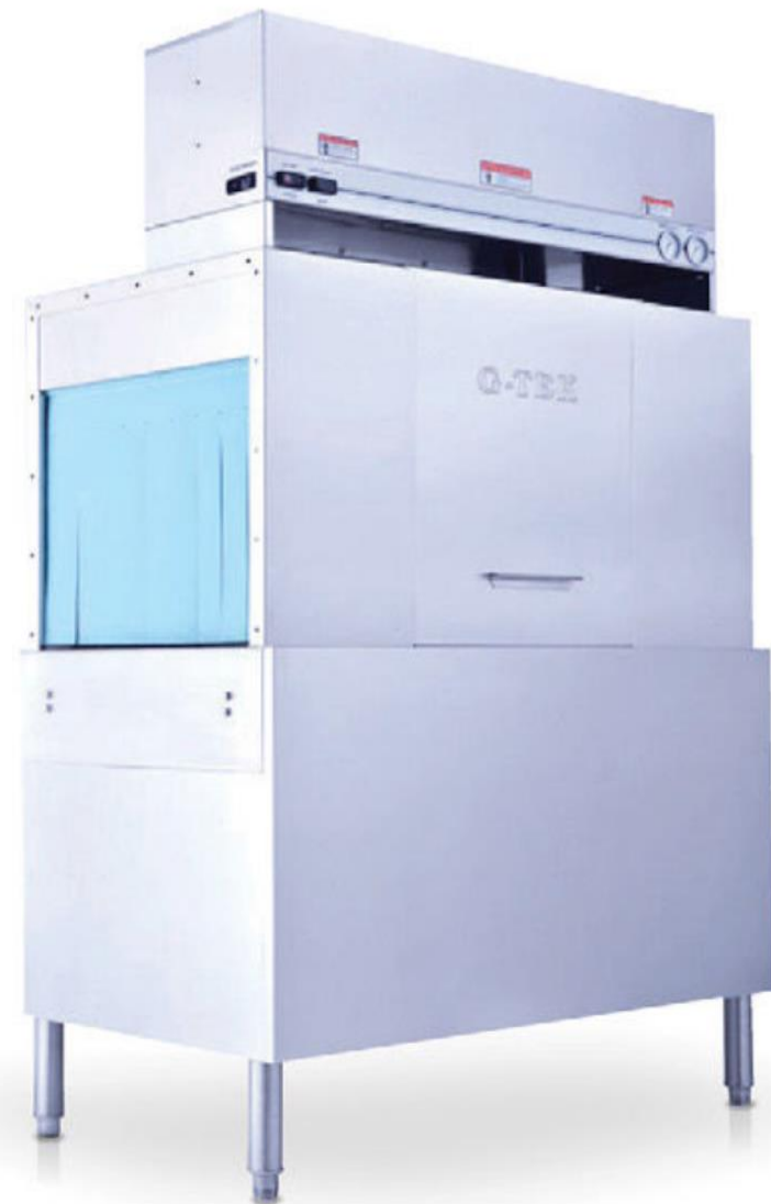
SINGLE TANK CONVEYOR TYPE DISH WASHER GT-CR1