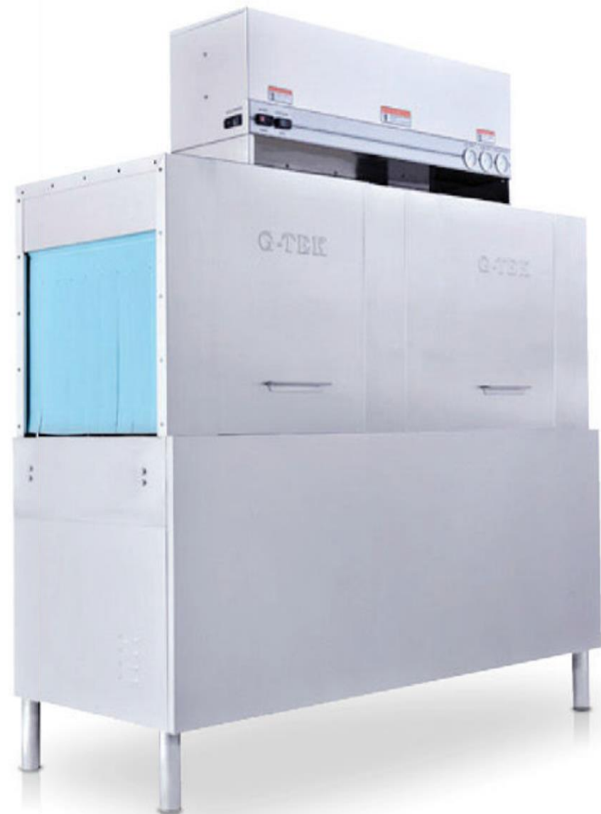
DOUBLE TANK CONVEYOR TYPE DISHWASHER GT-CR 2