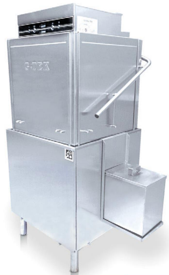
DOOR TYPE DISHWASHER WITH HEAT RECOVERY GT-D1M HR