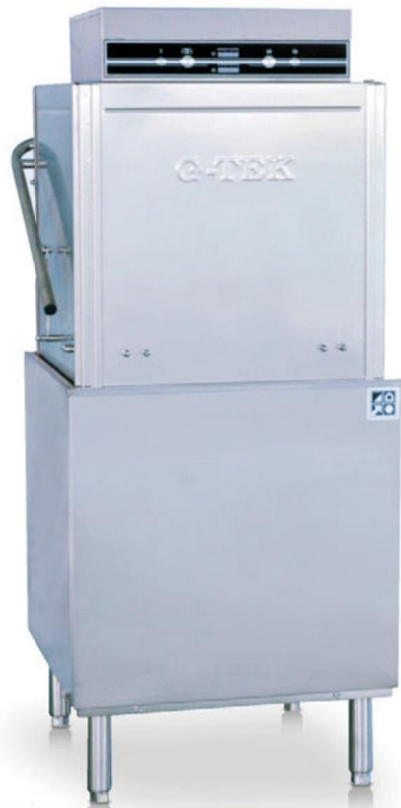
DOOR TYPE DISH WASHER GT-D1MTC • GT-D1MLE